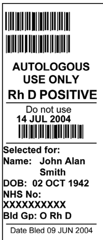
Figure 23.6 Label for unit with use limitations